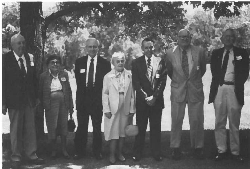
Fifty-year member honorees at the Belmont luncheon in May.

We were exceedingly pleased with this exciting meeting, which took place on May 23, 1997.