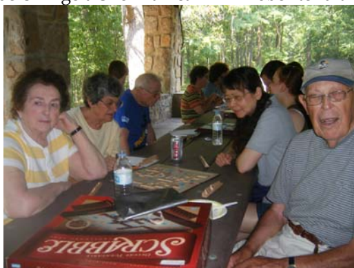
Numerous MD ACS members and their family members face-off in the Scrabble tournament