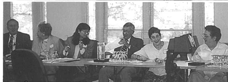
Scene from last year's 50-year member luncheon at Belmont. This year's affair is tentatively scheduled for May 28.