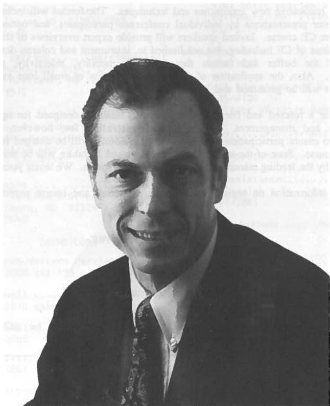
SOLOMON H. SNYDER