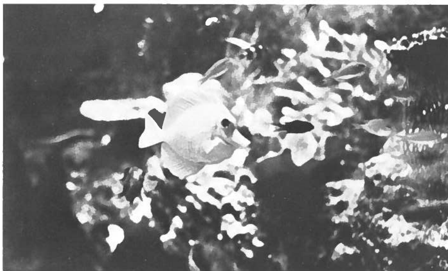
The Yellow Tang makes its home in the warm waters of the Aquarium's Pacific Coral Reef Exhibit. Some of the world's most colorful fishes can be found in this exhibit.