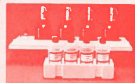
A 5-step reagent and standards kit, capable of 100 determinations, is also available.

This compact, self-contained, low-cost system makes determination of mercury in solids and solutions, organic or inorganic, or in air an inexpensive routine procedure. Coleman MAS-50 is so easy to operate, no special training is required.