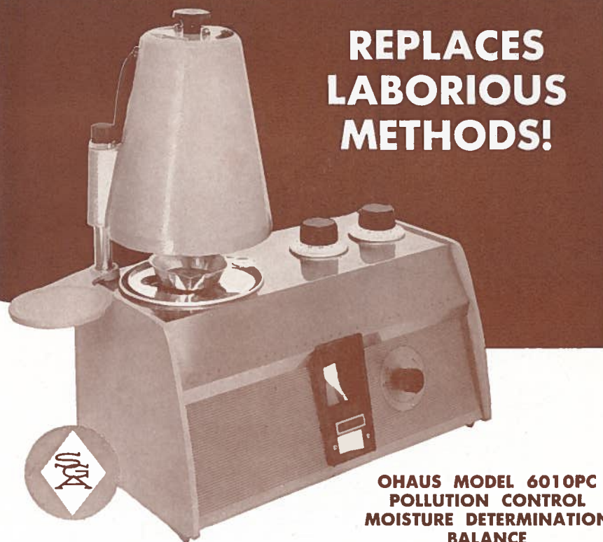
OHAUS MODEL 6010PC POLLUTION CONTROL MOISTURE DETERMINATION BALANCE

Not only does this 10-gram capacity instrument replace six pieces of apparatus normally used in pollution control, but it also saves valuable time. You can run a complete sludge solids content determination in 15 minutes (instead of the usual three hours) . . . accurately test for percent volatiles in 20 minutes, and for mixed liquor total solids in 30 minutes. Filter cake testing takes just 15 minutes.